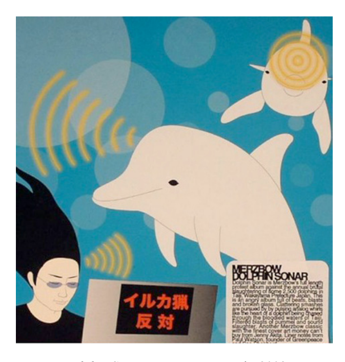
Dolphin Sonar, Important Records, 2008