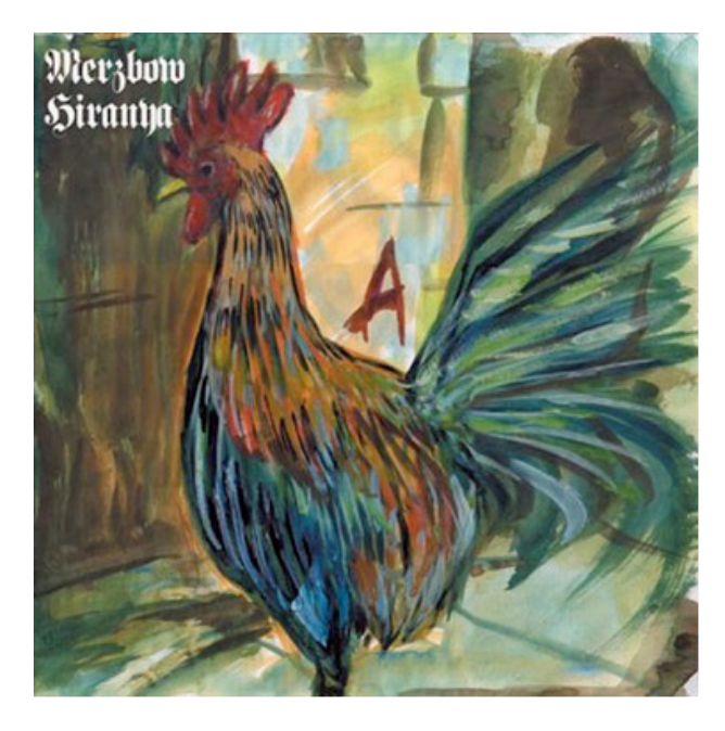
Hiranya, Noiseville, 2009.