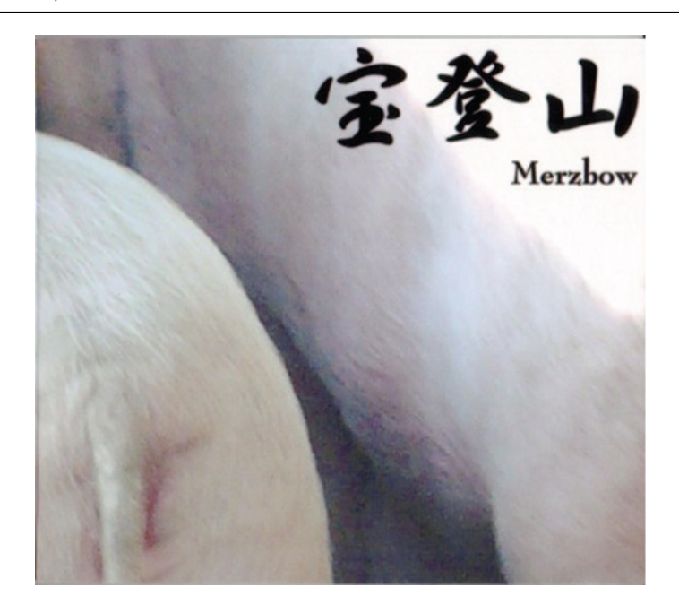
Hodosan, Vivo, 2008.