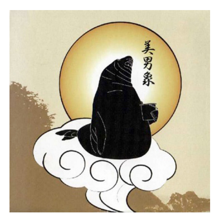
Minazo – Volume One, Important Records, 2006.

which is, as he personally said, more improvisatory, was recorded as a homage to Minazo, a giant elephant seal which shortly before that had died in a Japanese zoo. Minazo is shown on the album cover. Animals are featured on the covers of many other albums. Thus, Merzmorphosis, a ten-disc collection from 2012 shows turkeys; Kibako , from the same year, shows insects and flowers; Samidara, from 2013, shows a strange splice of rabbit and human; Jigokuhen, from 2011, shows a grouse; and Surabhi, from the same year, shows Indian holy cows. The album Dolphin Star was recorded in 2008 as a sign of protest against the killing of thousands of dolphins every year in a Japanese prefecture. By appropriation of animal sounds and by covers that depict the (non)human in the most diverse ways, Masami Akita wants to point to the bearing of a human being upon anything that is not a human being. Since he is a radical vegan and animal rights activist, these elements of his artistic practice are an attempt at changing the human attitude towards the environment, i.e. they suggest the possibility of building different ethics and aesthetics which will not be anthropocentric (nonmimetic aspect of the use of animal sounds). In fact, if extreme noise is also taken into account, then one can speak of the specific posthumanistic ethical and aesthetical policy of his artistic practice.